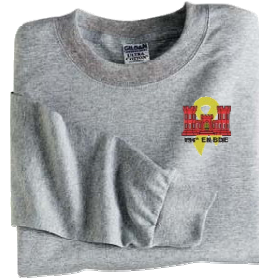
LONG SLEEVE T-SHIRT, $18