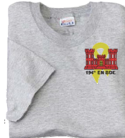
SHORT SLEEVE T-SHIRT, $12